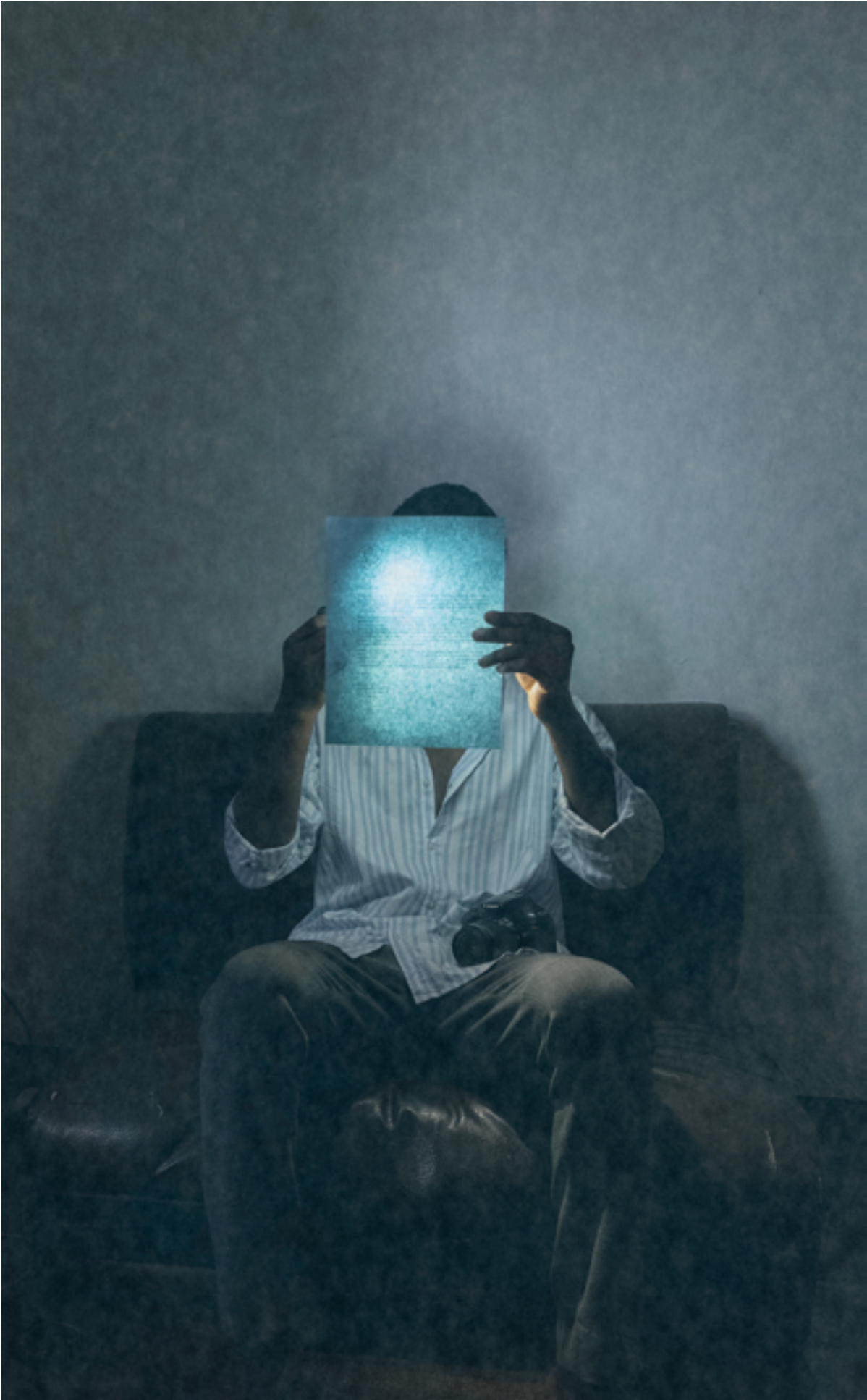
Blue Letter series (exhibited during the 2019 LagosPhoto Festival) © Anthony Ayodele Obayomi